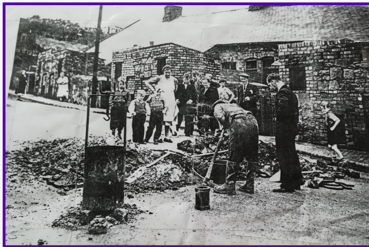
A burst pipe, Wood Street, Kimblesworth, 1954

Do you have any interesting, new or old, pictures of our parish? Would you be happy to share them with us and other members of our parish? Or do you have a photograph from more recent times that can be used to promote the beauty and diversity of our green and beautiful parish? If so please send them to our clerk (see details at the bottom of this page).