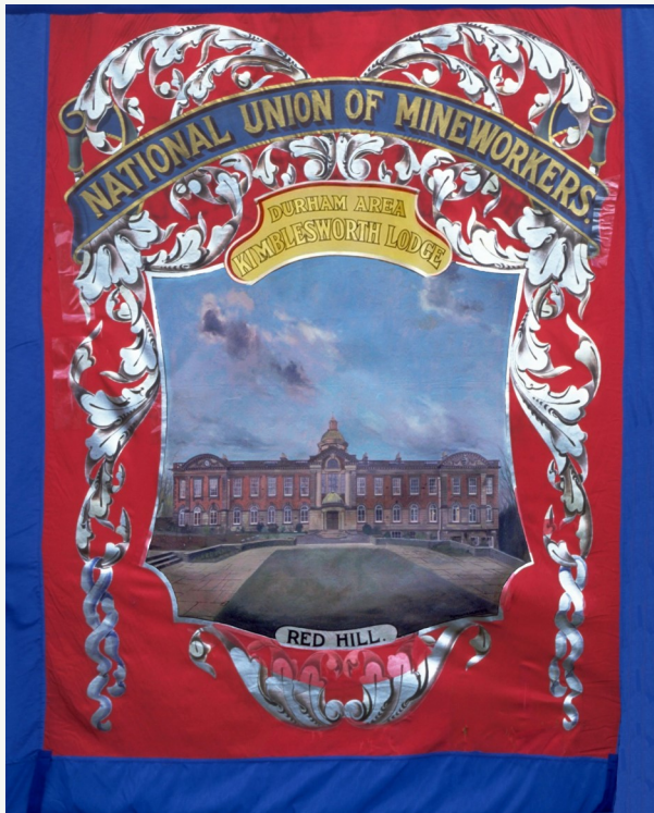
The Ushaw Moor banner was purchased and amended by Kimblesworth, circa 1960.

Pictures of our Parish Do you have any interesting, new or old, pictures of our parish? Would you be happy to share them with us and other members of our parish? If so please send them to our clerk (contact details on front page).